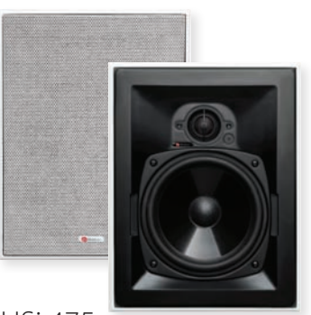
HSi 475 2-Way 6½" In-Wall Speaker